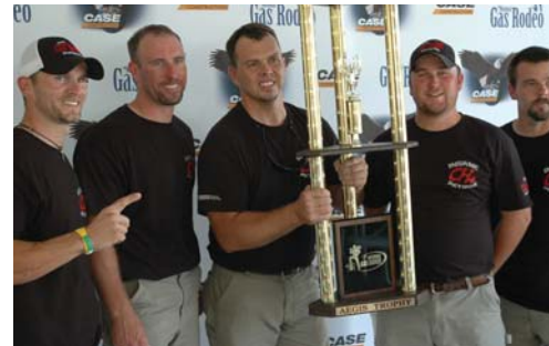
Insane Methane Piedmont Natural Gas